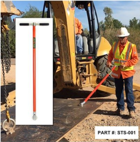
PART #: STS-001

Fixed length magnetic tag line safety tool. Guide trench plate and other heavy steel safely.