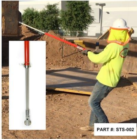
PART #: STS-002

Extendable magnetic tag line safety tool. More reach and adaptability on the job site.