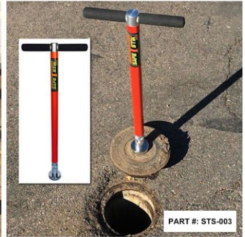
PART #: STS-003

Compact, lightweight and super powerful pulling and lifting tool.